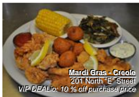
Mardi Gras - Creole 201 North "E" Street VIP DEALio: 10% off purchase price