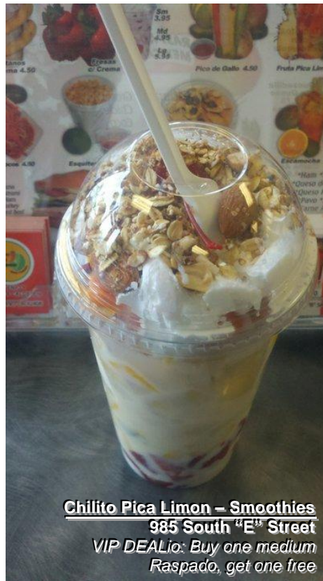
Chilito Pica Limon – Smoothies 985 South "E" Street VIP DEALio: Buy one medium Raspado, get one free