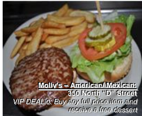
Molly's – American/ Mexican: 350 North "D" Street VIP DEALio: Buy any full price item and receive a free dessert

Cheers to a few of the Downtown staples that have been serving the appetites of San Bernardinians for years – and to new eateries – for bringing new flavor to the community of Downtown San Bernardino.