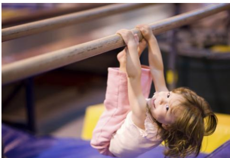
IEGA is so much fun! Classes will have your kids tumbling – and jumping for joy!

IEGA is a full-service gymnastics facility that trains athletes, cheerleaders and competitive gymnasts at a number of levels. Located on Orange Show Lane, this facility builds self-esteem, teaches physical fitness, and get's kids involved and moving – tumbling for that matter! Classes at IEGA are taught in sessions. Feel free to visit the website www.inlandempiregymnastics.com or call (909) 383-6655 to speak to a coach about signing your child up today! BONUS: VIP DEALio: One Free Class, New Members to Receive 10% off annual fee