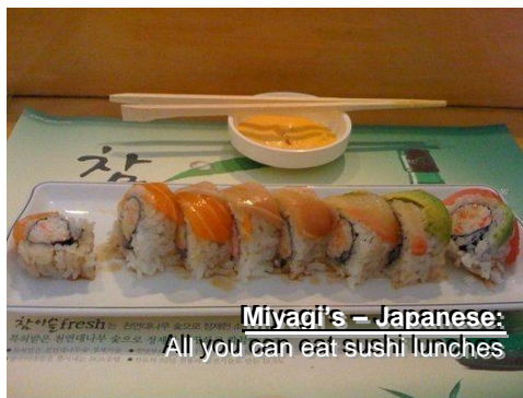
Miyagi's – Japanese: All you can eat sushi lunches