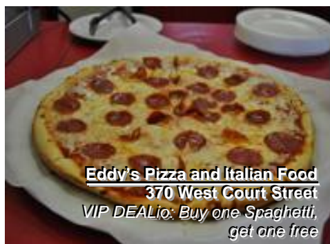
Eddy's Pizza and Italian Food 370 West Court Street VIP DEALio: Buy one Spaghetti, get one free