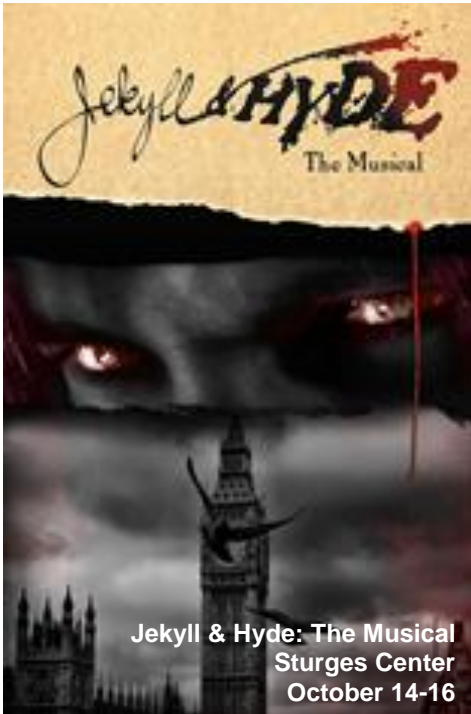
Jekyll & Hyde: The Musical Sturges Center October 14-16

No trick – just treats! Screams of fun and fright will echo in the streets of Downtown San Bernardino every weekend from October 14-30 during this year's inaugural Downtown San Bernardino Halloween Festival. This family-friendly horror-fest is a way for Downtown San Bernardino to create new holiday traditions and help drive the revitalization of our community. "Jekyll and Hyde, The Musical", on stage at the Sturges Center for the Fine Arts, will kick off the Halloween festivities on October 14. Below is a full listing of Halloween Festival events: