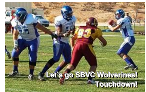
Let's go SBVC Wolverines! Touchdown!

Become a Wolverine fan and cheer for SBVC at the following upcoming home games: