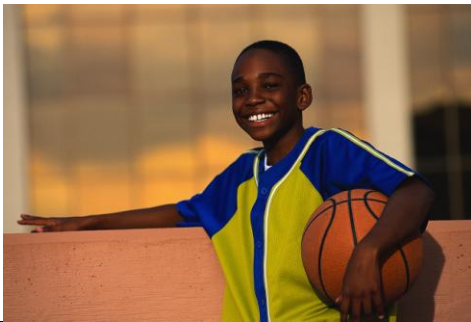
Swing into the next season of youth sports with the City of San Bernardino Parks and Recreation department!

From soccer to T-ball, flag football, tennis, gymnastics and more, the City of San Bernardino Parks & Recreation department has something for every little athlete. Get your child involved in youth sports today. Kids receive a T-shirt and the opportunity to learn skills, sportsmanship, and teamwork! For more information about a particular sport, please call (909) 384-5233. Interested in coaching your son or daughter? The department is looking for enthusiastic people to volunteer as coaches and/or officials!